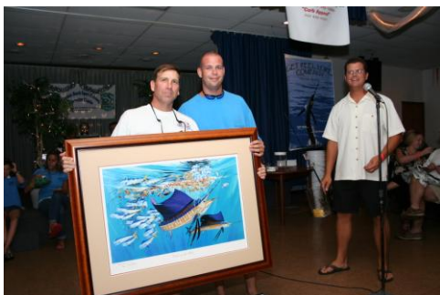
2007 Limited Edition Print