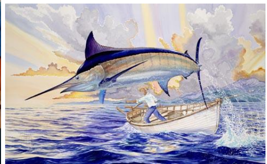
2008 Limited Edition Print